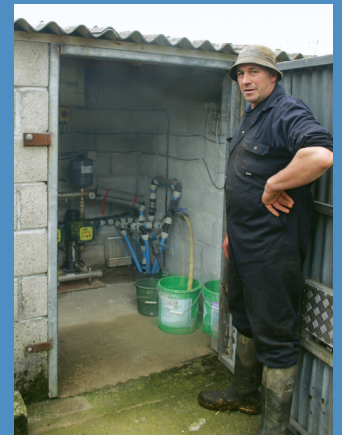
The farm's old electric pump and filter system.